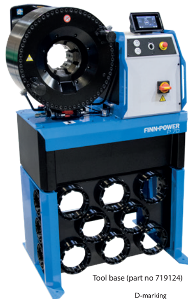
Tool base (part no 719124)