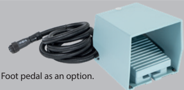
Foot pedal as an option.