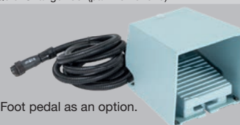
Foot pedal as an option.

Foot pedal (part no 691563) Electric backstop Mechanical back stop device Tool base with QuickChange-tool for P32 dies, 18 slots (part no 720198) Tool base with QuickChange-tool for P32 dies, 8 slots for 140 dies / 6 slots for 32 dies (part no 719124) Tool rack with QuickChange-tool (part no 692740) QuickChange-tool (part no 701049)