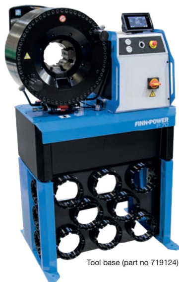
Tool base (part no 719124)