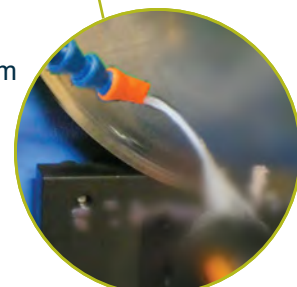
wet cut system