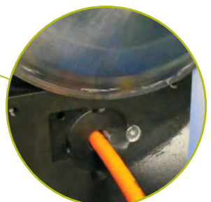
patented cutting technology