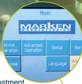
touch screen with auto adjustment