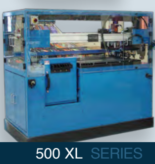
500 XL SERIES