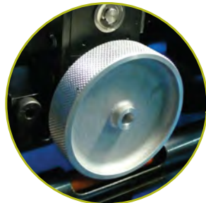
independent measuring system