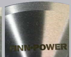
Smooth blade as an option.

FURTHER INFO ON OPTIONS, PLEASE REVERT TO SPECIFIC PRODUCT CARD