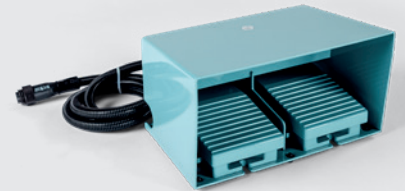
Foot pedal as an option (factory installation only).

Foot pedal (factory installation only) Mechanical back stop device Tool base with QuickChange-tool Tool rack with QuickChange-tool