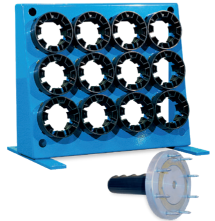
Tool base and Tool rack with QuickChange-tool as an option.