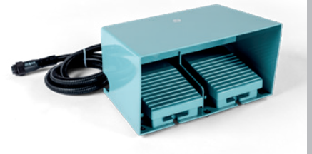
Foot pedal as an option.