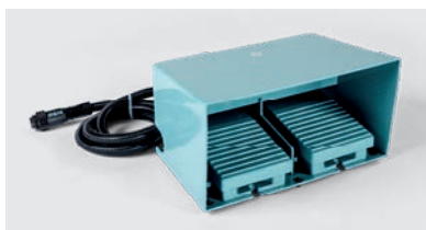
Foot pedal as an option.