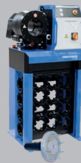
Tool base with QuickChange-tool as an option.

Foot pedal (part no 676906) Mechanical back stop device (part no 775510) Tool base (20 slots) with QuickChange-tool (part no 710579) Tool rack with QuickChange-tool (part no 692740) QuickChange-tool (part no 701049)