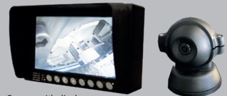
Camera with display as a standard feature.

Oil Condition Monitoring OCM Adapter dies for 160-series die sets, L220 (part no 404916) Oil cooler J3