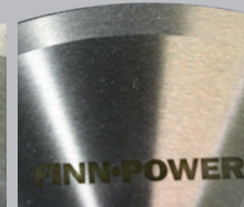
Smooth blade as an option.

FURTHER INFO ON OPTIONS, PLEASE REVERT TO SPECIFIC PRODUCT CARD