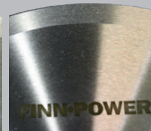
Smooth blade as an option.

FURTHER INFO ON OPTIONS, PLEASE REVERT TO SPECIFIC PRODUCT CARD