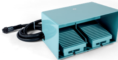
Foot pedal as an option.