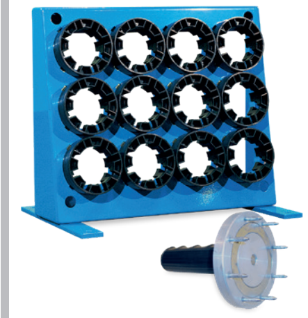
Tool base and Tool rack with QuickChange-tool as an option.