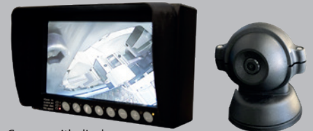
Camera with display as a standard feature.

Oil Condition Monitoring OCM Adapter dies for 160-series die sets, L220 (part no 404916) Oil cooler J3