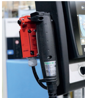
Remote control unit as a standard feature.