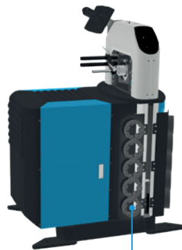
Side die rack as an option, 5 slots (Compact only)