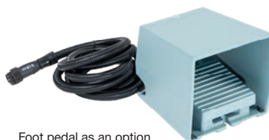
Foot pedal as an option.