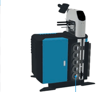
Side die rack as an option, 5 slots (Compact only)