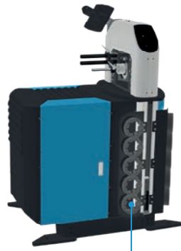
Side die rack as an option, 5 slots (Compact only)